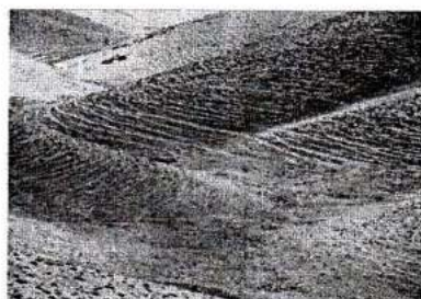
Fig. 5. Livestock trails on a slope. In the foreground large bushes of Phlomis thapsoides .

literature on the terminology of desertification. Due to the absence of precise criteria, desertification is often described as any deterioration of natural conditions of a given area. On the basis of an analysis of several studies devoted to the processes of desertification we have come to the conclusion that the exhaustion of at least 50% of the natural resources in a geosystem (ecosystem) should be considered as the beginning of the process of desertification. This represents a breaking point beyond which the natural circulation of nutrients and energy in geosystems is strongly broken.