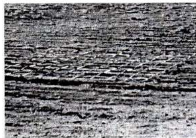
Fig. 3. White fences for measuring degradation of vegetation on slopes.

Due to the aridity of the climate, rangeland productivity is low. Geobotanists have estimated