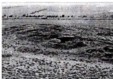
Fig. 4. Holes left after preparation of stones. In the foreground Phlomis thapsoides , in the background arable land.

The most serious impact on vegetation cover is that of cattle grazing. The negative influence of cattle on rangeland was found to increase