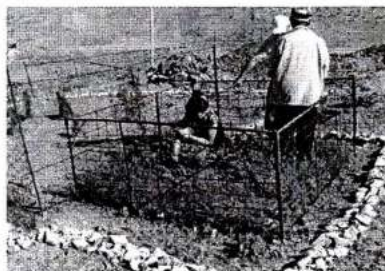
Fig. 2. Site no. 1 (60m 2 ). Seedlings of local trees and shrubs inside the fenced area. Outside the fence there is a hole and stones prepared for sale.

Three basic plots for experimental works are shown on the map, located at 500 m, 300 m and 2,000 m from Ishmantup settlement. All three plots were protected by an iron fence, within which plants developed in protected conditions without intervention of livestock. The first plot 10 m long by 6 m wide (Fig. 2).