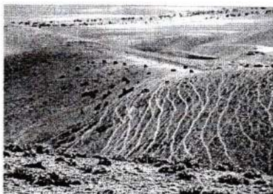
Fig. 6. Livestock trails on slopes.

If more than 50% of natural resources are lost nature can recover only very slowly and several decades are required to return to the previous state.